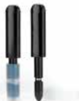
Front Rail Pins