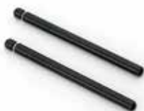
Balance Rail Pins

Lightweight Rockwell hardness tested anodized aluminum parts for durability and performance